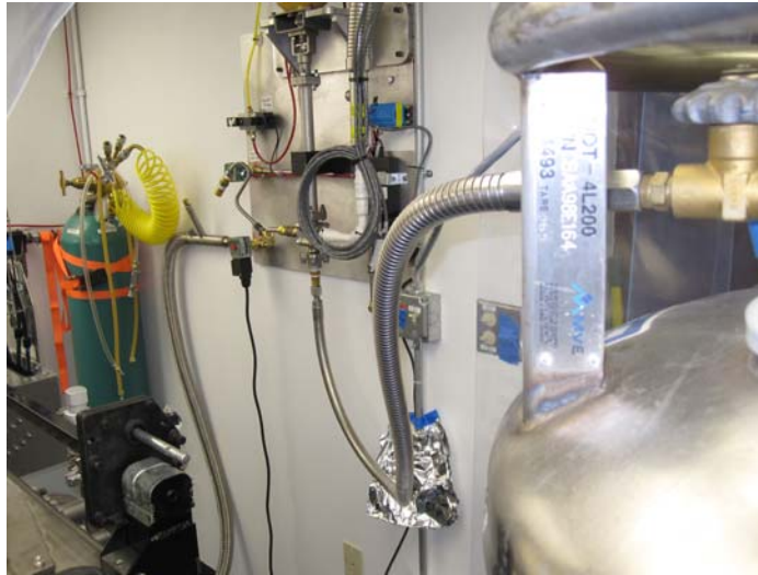
Fig 4. The dedicated fill hose for the instrument is just to the right of the GN2 bottle in the SW corner of the apogee lab. If necessary the hose can be disconnected from the solenoid valve (simple flare connection) and connected directly to a 180 liter storage bottle.

If only the Vacuum alarm triggered then we do not want to fill with cryogenics until potential leaks have been investigated and resolved.