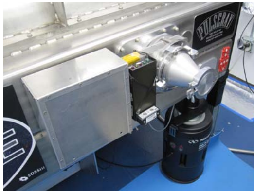
Fig 3. Instrument gate valve with ISO-100 to KF-50 reducer for the observatory vacuum pump. The sheet metal box to the left covers the gate valve handle.