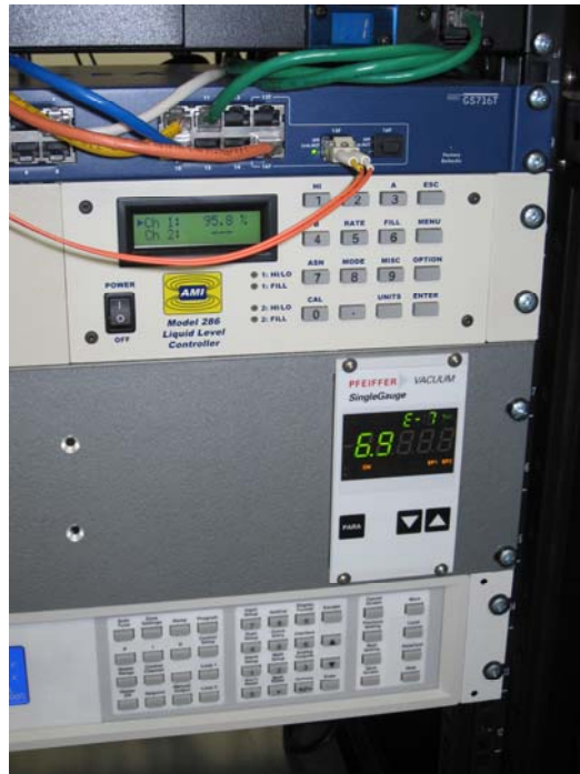
Fig 1. Portion of the Electronics Rack in the Apogee Lab. LN2 level is displayed on Channel 1 of the Liquid Level Controller (95.8% in the picture) and pressure is indicated on the Pfeiffer Gauge (6.9 e-7 Torr in the picture)